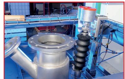
With bellows in a filling station for powdery, dangerous goods