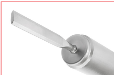
Vibrating paddle also measures very light bulk materials