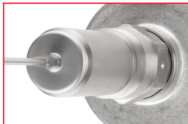
Sensitivity of the vibrating paddle can be set in three levels